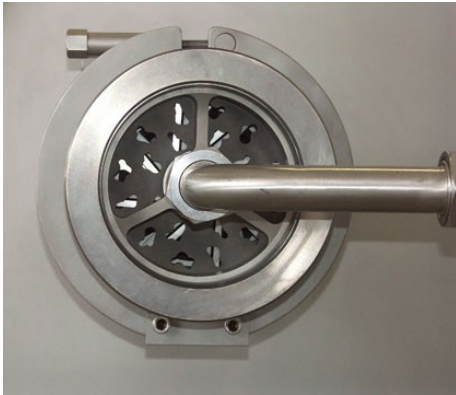
Plate Model # 400mm Wolfking